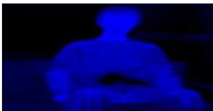
Figure 6: HSV Image