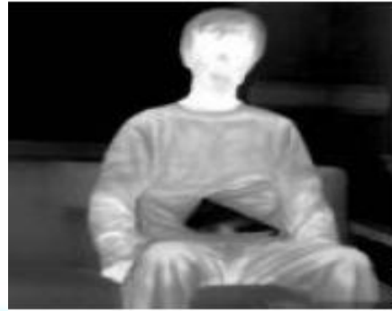
Figure 2: IR Image

Combine basically add visual image and IR image and the result is shown in figure 3 . Actually we want to detect the hiding details from figure 3 but image from figure 3 is hazy, so we do not get enough information from figure 3 . Complement the IR image which is useful in the next operation and this complement image is shown in figure 4 . IR image lies the intensity between 0 to 255 intensity thus complement means subtracting all matrix component from 255 and we get complemented form or reverse form of the IR image. Then add visual image and complemented IR image which is shown in figure 5 .