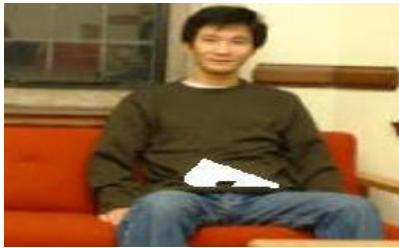
Figure 10: Weapon in visual image

Contour detection is used to detect edges of weapon from the weapon binary image. Edge detection refers to the process of identifying and locating sharp discontinuities in an image. The discontinuities are abrupt changes in pixel intensity which characterize boundaries of objects in a scene. There is an extremely large number of edge detection operators available, each designed to be sensitive to certain types of edges. Here we use canny edge detection techniques. The Canny edge detection algorithm is known to many as the optimal edge detector. Canny's edge detection algorithm is computationally more expensive compared to Sobel, Prewitt and Robert's operator. However, the Canny's edge detection algorithm performs better than all these operators under almost all scenarios. This contour detection of concealed weapon is shown in figure 11