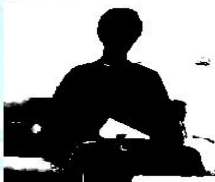
Figure 8: Fused Gray Image

This step is required for the next step in which we use a binarization technique. There are several binarization techniques among them Otsu, Bernsen, savala, th-mean, niblack and iterative partitioning as a framework method are showing good result for this type of image. Here we use Otsu method which is a global Thresholding method i.e threshold value are calculated locally and get the result, no extra threshold value is added here. Extract this weapon portion by calculating all connected area component then remove too small component according to the area values. This only weapon portion binary image is shown in figure 9 . Let us we want to show the weapon in the actual RGB visual image. The weapon binary images are stored into three different components because we want multiply it with three dimensional RGB image. Multiply individual element to element between two matrixes. In this step we detect weapon with visual RGB image is shown in figure 10 .