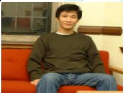
Figure 1: RGB Image

The weapons detection algorithm consists of several steps which will be explained in detail in the following. Take two images in the same pose visual RGB image and IR image which are shown in figure 1 and figure 2 . Resize these two types of image because image fusion and addition are not able to perform if the sizes are not same.