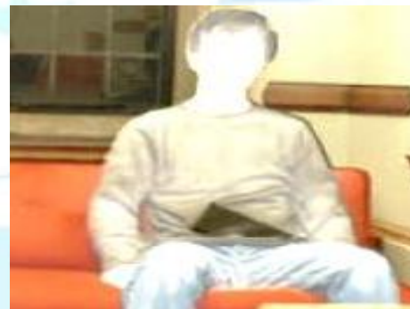
Figure 3: Combined Image

Combine basically add visual image and IR image and the result is shown in figure 3 . Actually we want to detect the hiding details from figure 3 but image from figure 3 is hazy, so we do not get enough information from figure 3 . Complement the IR image which is useful in the next operation and this complement image is shown in figure 4 . IR image lies the intensity between 0 to 255 intensity thus complement means subtracting all matrix component from 255 and we get complemented form or reverse form of the IR image. Then add visual image and complemented IR image which is shown in figure 5 .