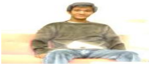
Figure 5: Combined 1 Image