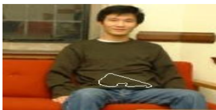
Figure 12: Contour with Visual Images

Then this binarizes contour image are divided into three component and multiply as before and get contour with visual RGB image which is shown in figure 12 where we can see the concealed weapon under person clothes easily.