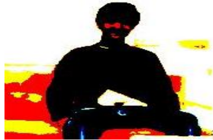
Figure 7: Fused Image